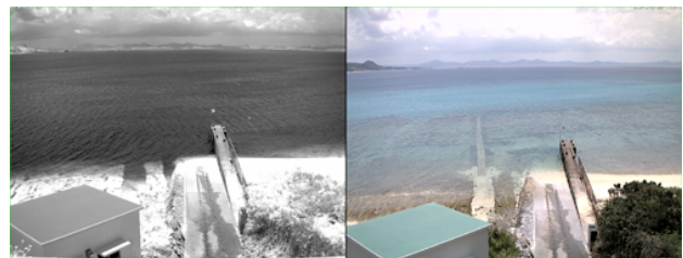
Figure 1. Example of captured near-infrared (left) and visible (right) images.

Ground-truthing for benthic cover and shoreline positions was performed by observing coverage of corals and seaweeds with a quadrat and by tracing shorelines, respectively, during the camera monitoring.